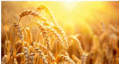
Grain fields in summer: Even at very high temperatures, the IMS shows no weakness