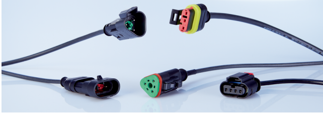
Implementation of mobile plug connectors common in the industry