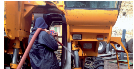
The very tight IMS housing withstands regular high-pressure cleaning without any problems