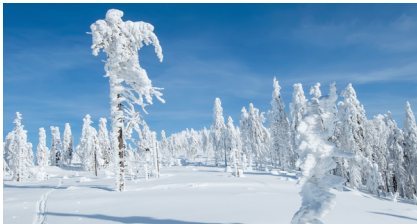
Winter in Siberia: -40 °C. While others freeze, the IMS works perfectly

Mobile machines can be used in any weather. Impacts and vibrations as well as rain, snow, frost, dirt, oil residues, cold or heat heavily impact the sensors installed in the machines. Other factors are aggressive machine cleaning processes. IMF inductive proximity sensors master these challenges with their tight and rugged design. The IP68 and IP69K enclosure ratings, high impact and vibration resistance as well as wide specification limits enable maximum operating times for your machine.