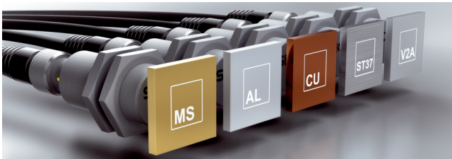
The same sensing range on all metals thanks to reduction factor 1