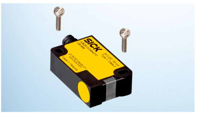
Two holes, two screws: That's all you need to mount the IQB2S on the machine. It can be quickly aligned using the hole pattern provided on the safety switch.