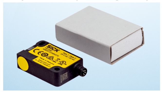
With its slim, compact format no bigger than a matchbox, the IQB2S can fit in any machine design.