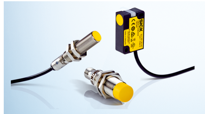
The IQB2S exhibits high tolerance to deviation. And, just like the IME2S inductive safety switch, it features non-contact operation and has a very low wear rate.